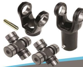
SPIDER UNIVERSAL JOINT SHAFT