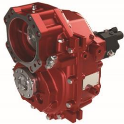
BRAKE TRANSMISSION DISCS

TRANSMISSION TORQUE CONVERTER AND AXLE PARTS PROVIDES THE FINAL SOLUTION