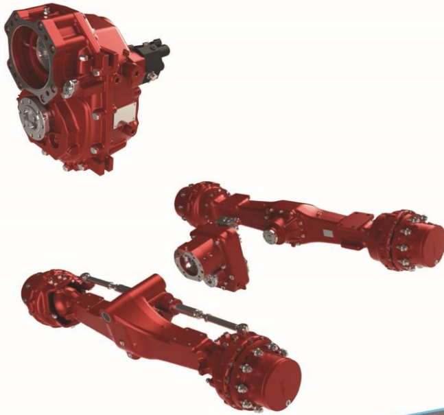
BRAKE TRANSMISSION DISCS

TRANSMISSION TORQUE CONVERTER AND AXLE PARTS PROVIDES THE FINAL SOLUTION