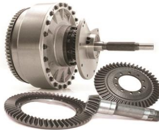
TRAKE TRANSMISSION DISCS